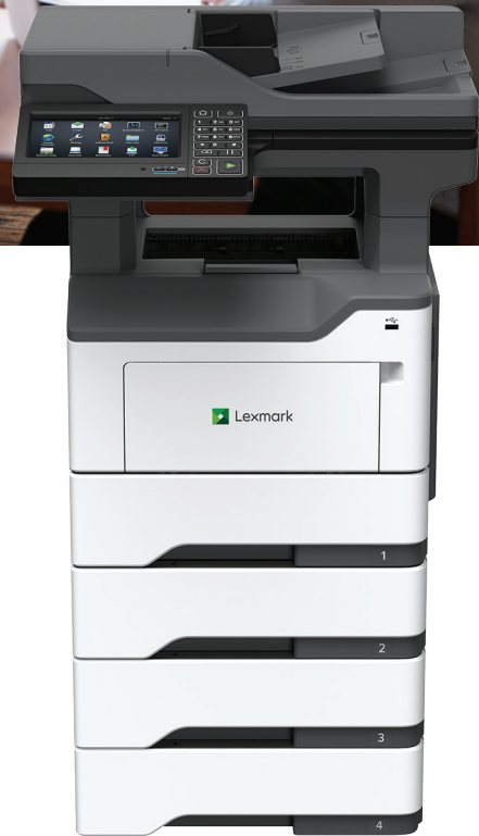
MX622adhe with optional trays